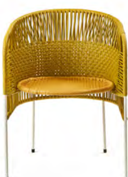
curry yellow/honey yellow/ pearl white 01ACADC-U