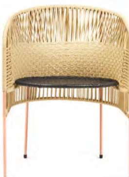
beige/black/beige pink 01ACADC-W