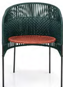
moss green/copper/black 01ACADC-I