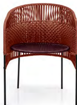
copper/black red/black 01ACADC-O