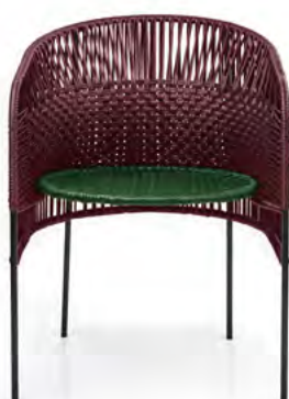
black red/moss green/black 01ACADC-M