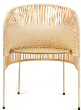
pastel beige/beige/pearl white 01ACADC-V