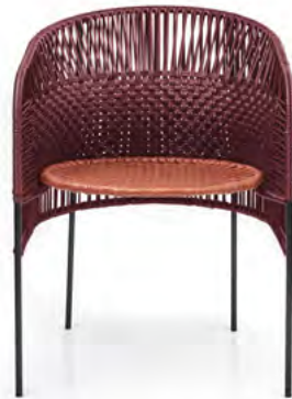
black red/copper/black 01ACADC-N